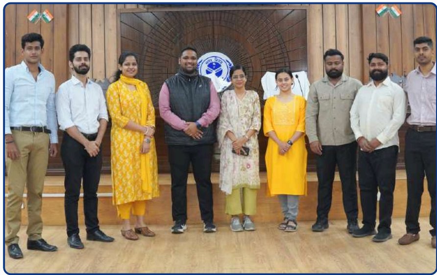
Praja and UDRI teams after the workshop in Gorakhpur