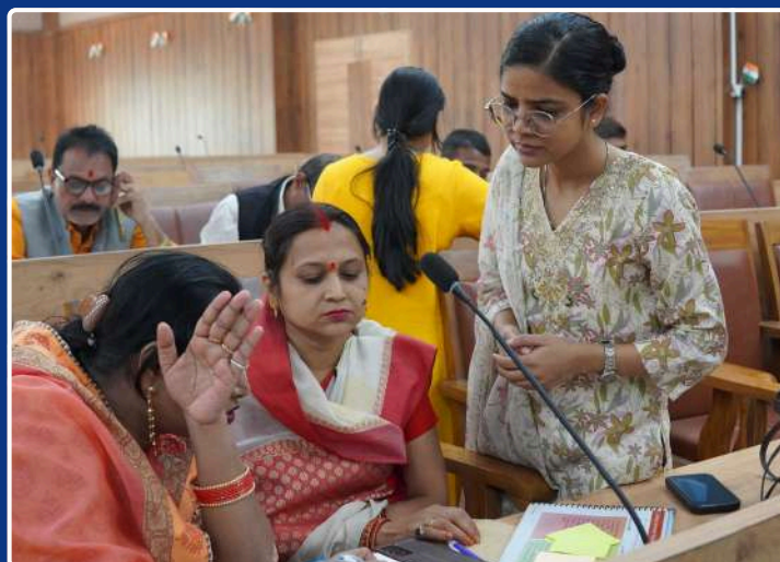
Councillors understanding the Spatial Planning concepts

The sessions gave an overview of the extent of urbanisation over the years and the planning projects currently being undertaken in each city. This was followed by an introduction to the relevant planning guidelines, including the Uttar Pradesh Urban Planning and Development Act, 1973, and the Urban and Regional Development Plans Formulation and Implementation (URDPFI) Guidelines, 2014. The session further explained the institutional requirements for plan preparation, such as the role of the Development Authority, and an overview of the Uttar Pradesh Building Construction and Development Bye-laws, 2025. The workshop also focused on “how to read a master plan” through an interactive exercise that involved identifying key components of a map, such as legends, direction, scale, and other essential elements.