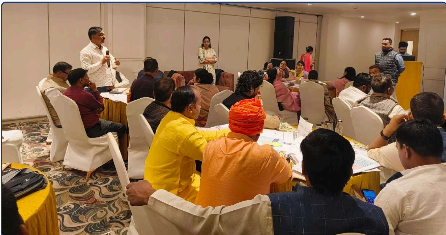
Councillors of the Varanasi Municipal Corporation during the workshop on Spatial Planning