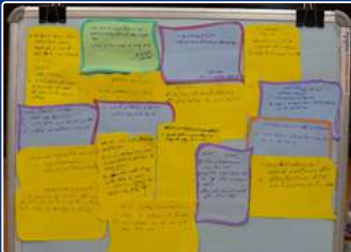
Expectation-setting activity with councillors

This was followed by an overview of the Municipal Corporation's departmental structure, with an explanation of the functions assigned to each department. Hariprasad explained the core components of the municipal budget, with financial concepts illustrated through comparisons with household budgeting. Councillors actively raised questions and sought clarifications on technical aspects.