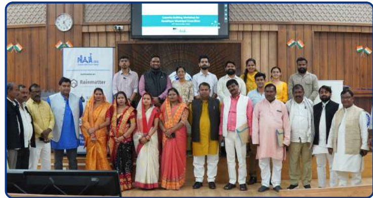
Members of the Praja and UDRI teams with councillors of the Gorakhpur Municipal Corporation