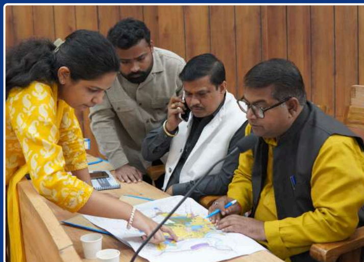
Praja and UDRI teams with councillors of the Gorakhpur Municipal Corporation