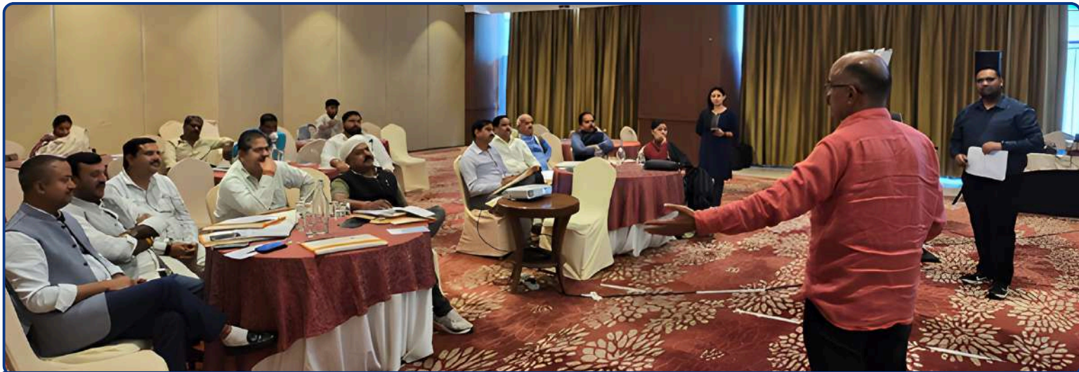
Councillors of the Lucknow Municipal Corporation during the workshop on Municipal Finance.