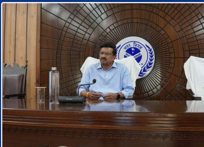
Manglesh Kumar Srivastava, Mayor of the Gorakhpur Municipal Corporation