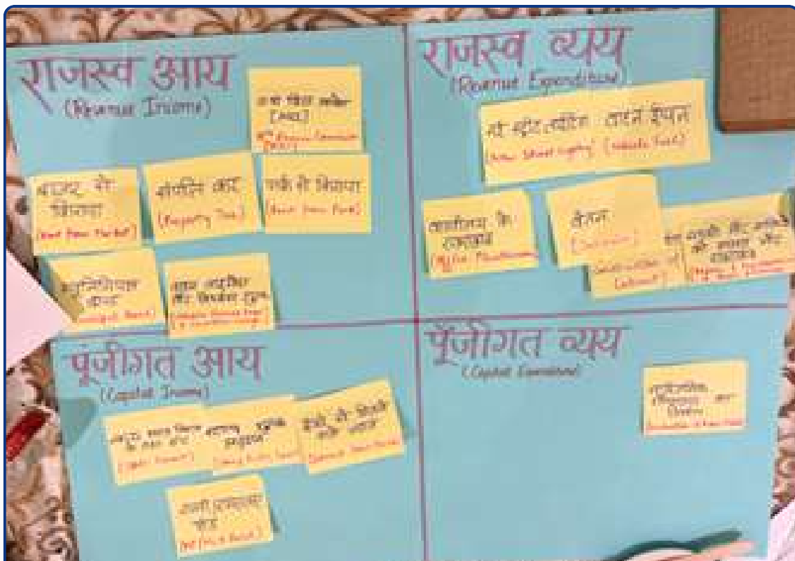
Councillors actively participating in activities during the session

Facilitators shared practical examples and explained the relevant statutory provisions governing these areas.