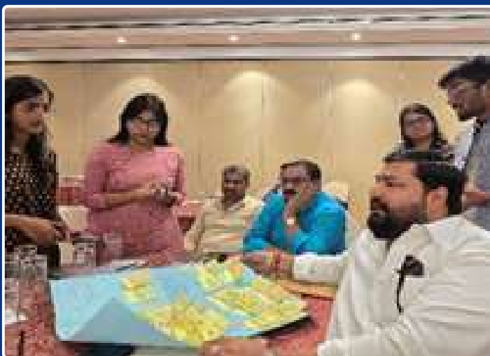
Councillors of the Lucknow Municipal Corporation