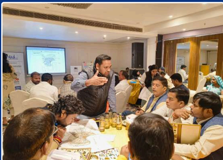
Praja team with councillors of the Varanasi Municipal Corporation

The Workshops in Varanasi and Gorakhpur were organised for the councillors to provide an understanding of the Spatial Planning practices at the Regional, City, Zone as well as neighbourhood level. The sessions were designed to help them understand the impact of large-scale plans on their respective wards through interactive activities.