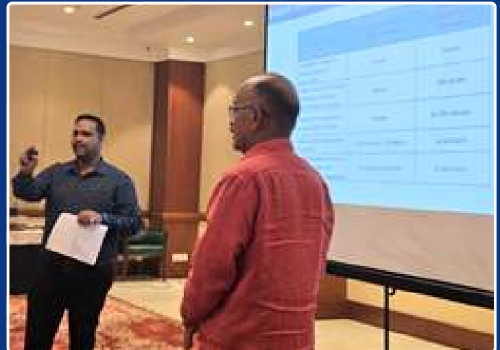
Praja team during the workshop